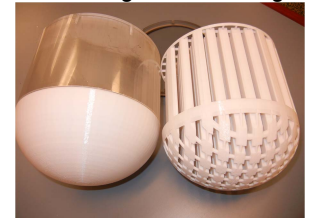
Fig. 1: cylindrical phantom and grid insert

References: [1] Pierpaoli, et al. , 17 th ISMRM, 1414, 2009. [2] Merkle, et al. , MRM, 66:901-910, 2011. [3] Duan, et al. , NMR Biomed, 26:1070-1078, 2013. [4] Pierpaoli, et al. , 18 th ISMRM, 1597, 2010. Acknowledgement: PVP permittivity measures by Dr. Ryan Brown, NYU.